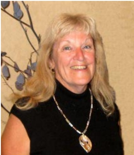
Governor Ardis Moody