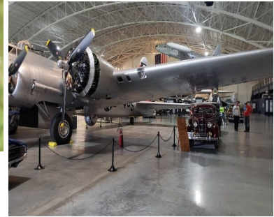
Study Aerospace At SAC Museum June 28 th