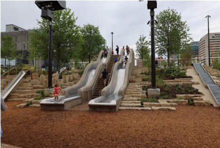
Tour Omaha & Enjoy Pizza at Leahy Mall June 14 th