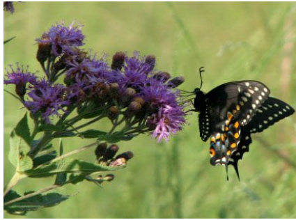
Study Plant & Insects At Glacier Creek Preserve, June 7 th