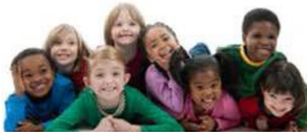
Discover Sunken Ship & Wild Life at Desoto Bend June 21 st