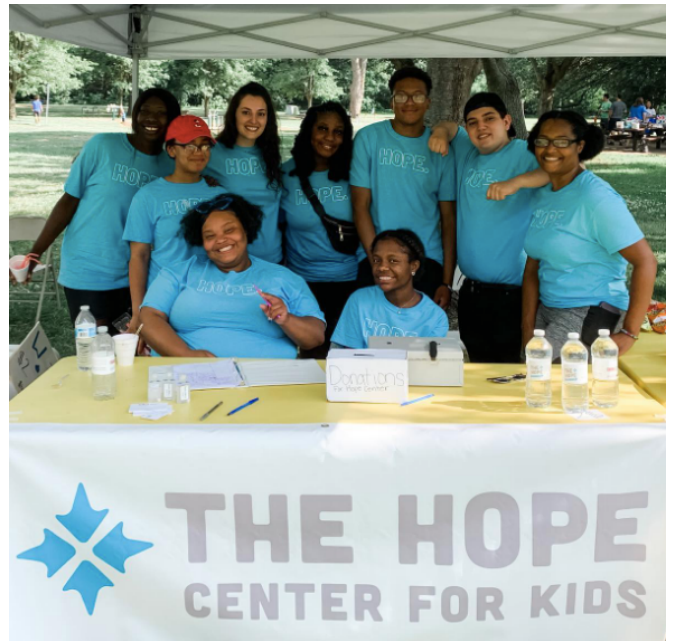
The support staff at The Hope Center.

The Omaha Metro Area Optimist Clubs and the Metro Area Youth Foundation collaborated with the Hope Center for Kids to sponsor a “Summer of Growth & Opportunity” for inner city youth. The Hope Center for Kids, located at 2200 No. 20th St. in Omaha, provides social, personal and career training, safe after school activities, summer developmental programs, tutoring, and counseling during the week.