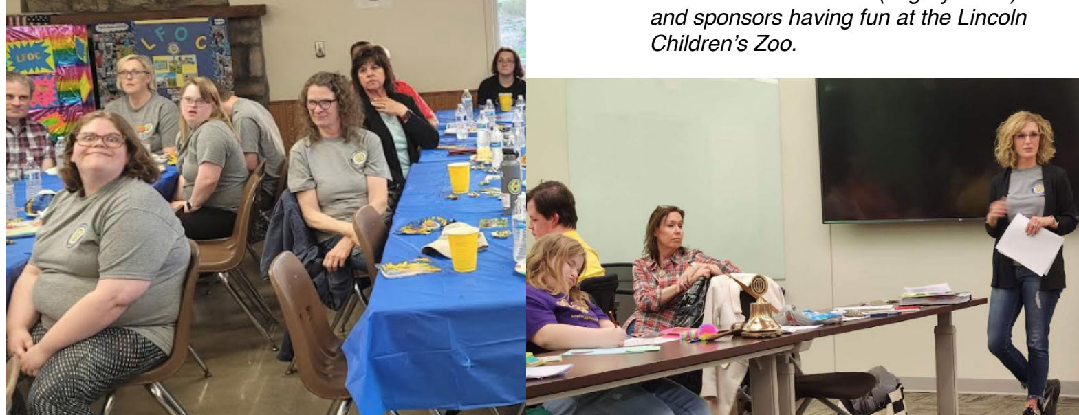
The Lincoln Friends Club celebrates their five year anniversary with friends and cake!