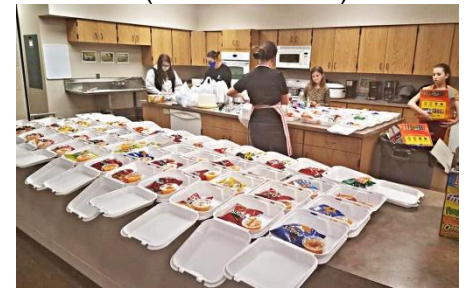
Preparing the light dinners

The Norfolk Noon Optimist Club is sponsoring Prime Time Online on consecutive Tuesday nights from March 23 rd through April 27 th . Twenty families have joined on Zoom, which also includes a light dinner, great children’s books and lively discussions. (From Facebook)