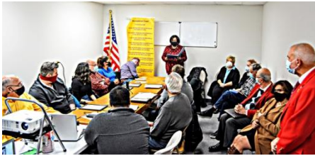
One End of the Table