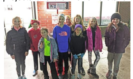
The Outlaws help out by ringing bells.

Papillion-LaVista and South Omaha Optimist Clubs were among the many clubs that rang bells for the Salvation Army and other charitable groups. These two clubs had the assistance of the Outlaws Softball teams. The clubs partner with the Outlaws by helping to support them financially and the Outlaws volunteer their time to the clubs by helping with projects and the fireworks stand.