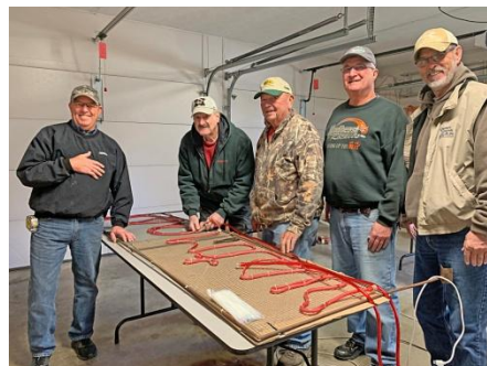
Seward members repairing the Christmas lights for the Bemis Park display.

Seward may be known as the 4th of July City, but the Seward Optimist Club makes it a Christmas City. The club hosted a Movie Day for the community. It was free to adults and children with a donation of two toiletry items per person. The club also decorated Bemis Park with Snoopy characters and made repairs to the lights. For the Sixpence project, the club was able to provide 29 families with passes to the Children's Museum and annual passes to the Lincoln Children's Zoo.