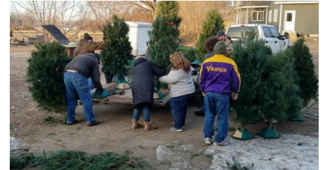
Norfolk Noon members loading the trees on the trailer for delivery.

While many clubs were recovering from the Holiday projects, Norfolk Noon has taken advantage of the after Christmas sales and purchased most of the supplies they will need for the 2020 Operation Christmas Tree project. This included getting trees from Menards in Norfolk, Columbus, and Elkhorn. During the 26 years the club has sponsored this project, they have delivered 902 trees to 2,741 children. Forty-seven trees were delivered this past Christmas.