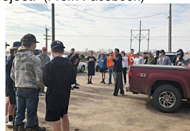
Getting clean-up instructions

Humphrey Pond Spring Cleanup 2021 has been completed. In addition to Ogallala Optimist members, the Ogallala High School football coach and 26 of his players helped with the project. (From Facebook)