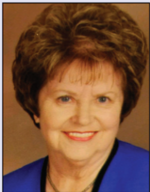
Zone 7 Lieutenant Governor Judith Kluge

COLUMBUS—10020 Fridays at Noon HyVee Meeting Room 3010 23rd St.