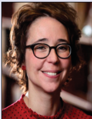
Zone 1 Lieutenant Governor Wendy Townley