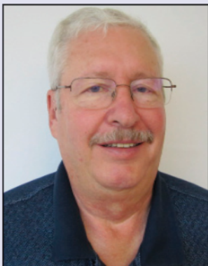
Zone 5 Lieutenant Governor Marvin Shimmel