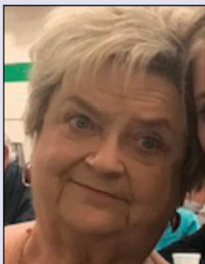
Zone 2 Lieutenant Governor Carla Gries