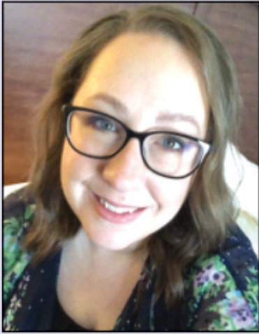
Zone 4 Lieutenant Governor Diana Rizzo

NORFOLK – 10065 Wednesdays at 7 a.m. First Choice Catering, 1110 S 9th St.